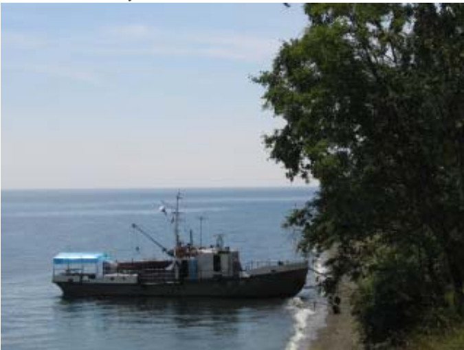
Rail way around Baikal lake. Excursion boat.