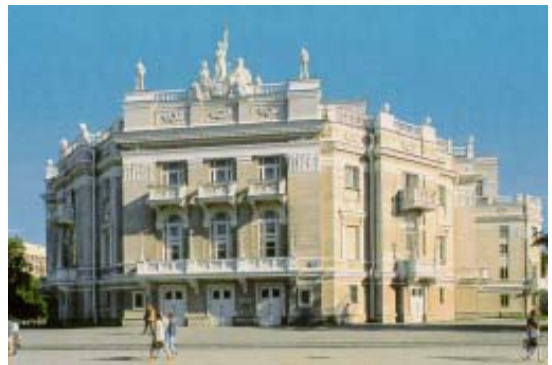
Yekaterinburg. opera theater