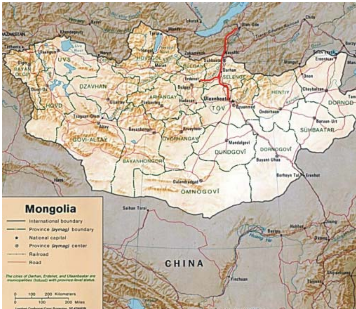
Excursions in Mongolia.

Cost trip is 2290 euro for 1 tourist for group 7 tourists.