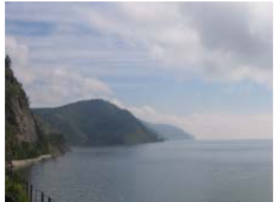
Rail way around Baikal lake. View on Baikal lake.