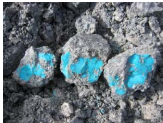
Erdenet quarry. Turquoise