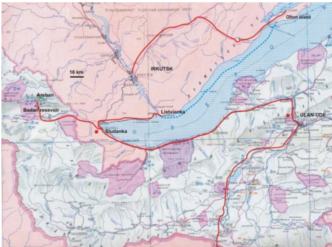
Excursions around Baikal lake.