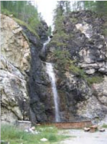
Waterfall Kingirgi II.

Excursion to Buryat Badari reservoir (30 km)