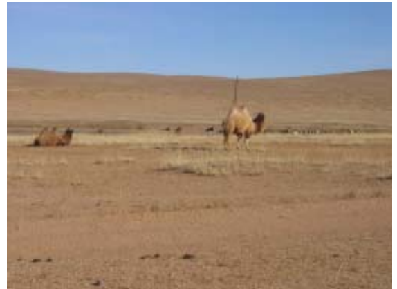
Gobi desert Camels.