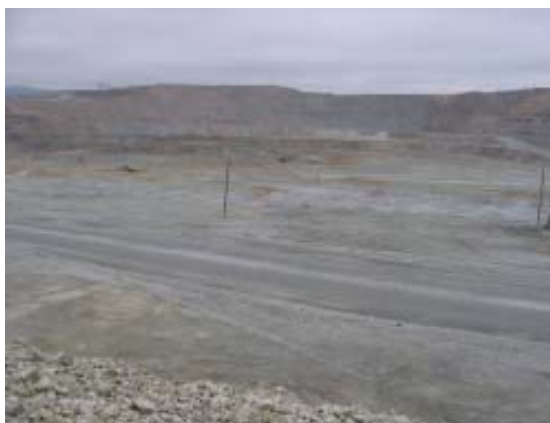
Erdenet copper quarry.

Crossing to Ulaanbaatar city (Mongolia) by rail way. Accommodation in hotel. Walking to city.