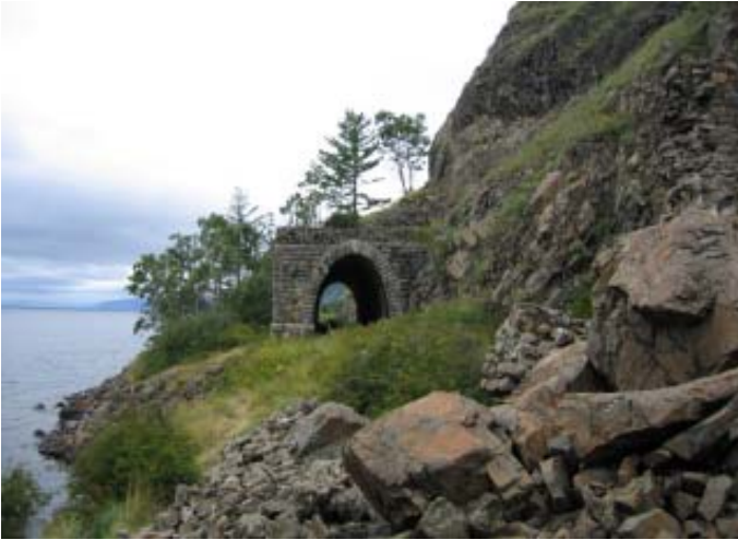
Rail way around Baikal lake. Deserted tunnel.