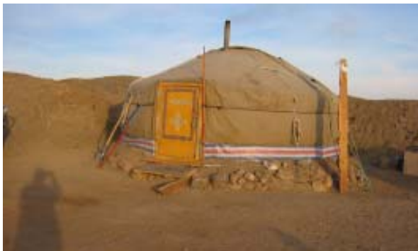
Mongolian nomad's tent.