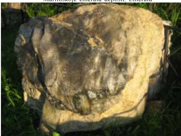
Sludites-rocks conenting beryls and emeralds.