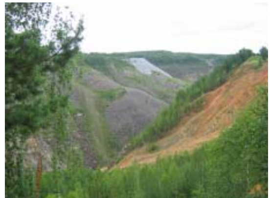
Mariinskoje emerald deposit.