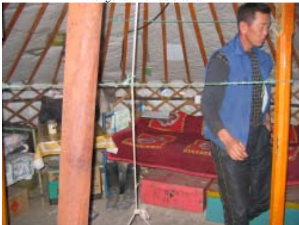
Inside nomad's tent.