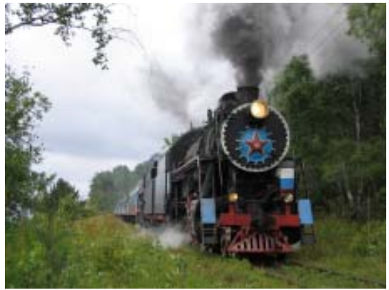
Rail way around Baikal lake.