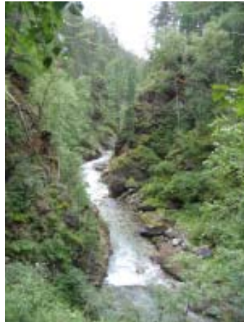
Waterfall Kingirgi II.