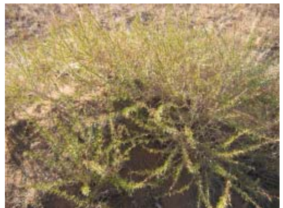
Gobi desert. Camel thorn.