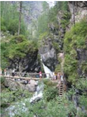
Road to waterfall Kingirgi I.