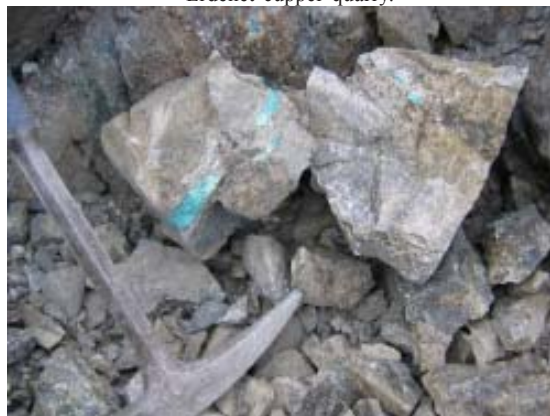
Erdenet quarry. Turquoise