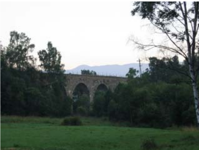
Rail way around Baikal lake.