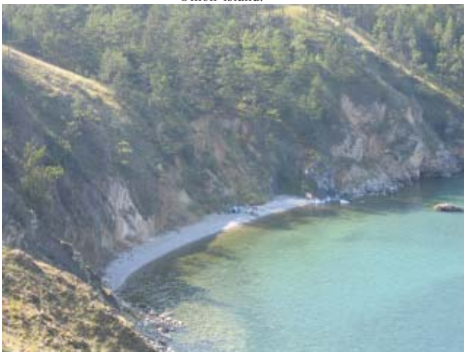
Olhon island. Beach