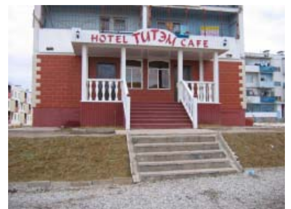
Erdenet city. Hotel Titem.