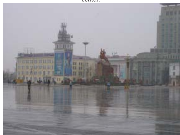
Ulaanbaatar city. Center squer.