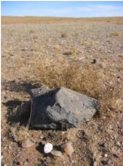
Gobi desert. Plaser of agates.