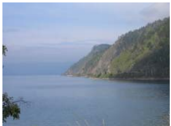
Rail way around Baikal lake. View on Baikal lake.