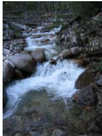
Waterfall Kingirgi I.