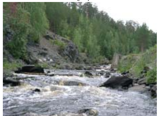
Malishevo. Standing near Reft river.