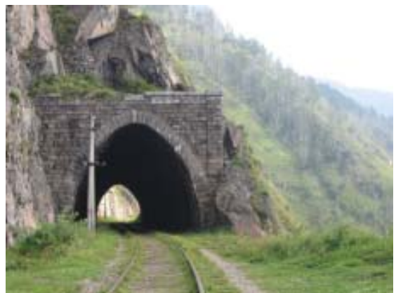
Rail way around Baikal lake.