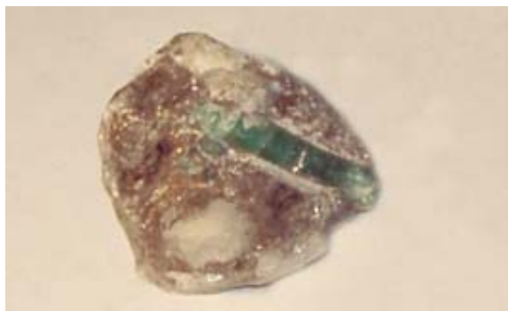
Mariinskoje emerald deposit. Emerald