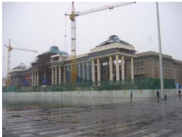
Ulaanbaatar city. Construction Chinggis Khaan monument in center.